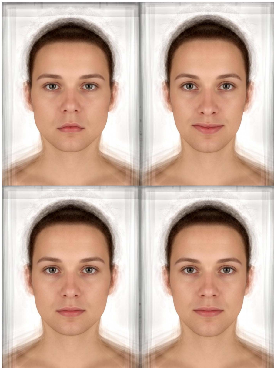
Fig. 2. Face shape visualisations of low (left) and high (right) perceived intelligence (top) and IQ (bottom). Each visualisation is 3SD from the mean face shape.

near-zero in all cases; therefore, we can be confident that familial factors are driving the correlation between perceived and measured intelligence.